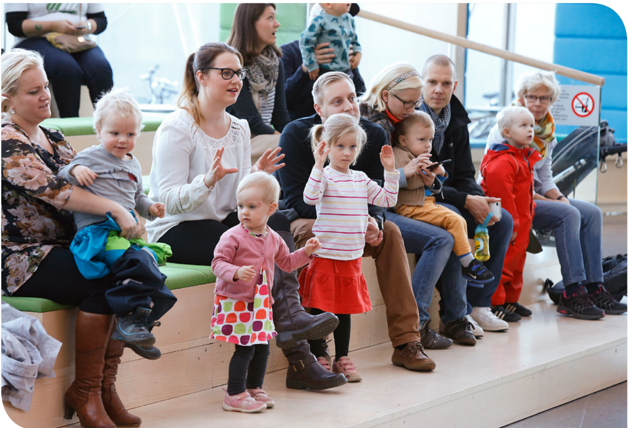
25year celebration at Sanoma House Media Square in Helsinki.

Environmentally friendly choices have now become easier for travellers with all Scandic hotels in Finland qualifying for the Nordic Ecolabel in 2015.