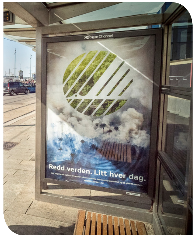
Outdoor campaign in Norway.