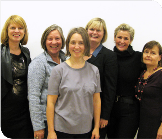
Several representatives from the Nordic Ecolabelling Board.