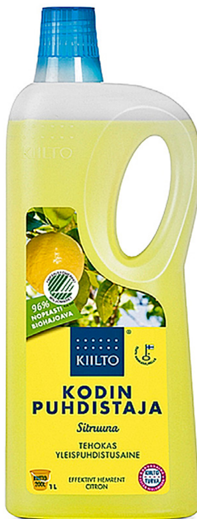
One of KiiltoClean's many Nordic Swan Ecolabelled cleaning products.

KiiltoClean Oy will continue using the Nordic Ecolabel but will also continue to evaluate the costs and benefits carefully.