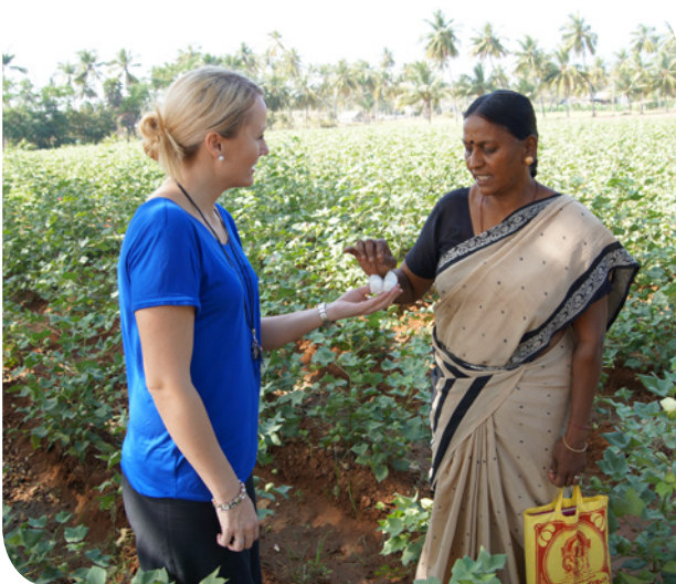
It is important to look at a product's entire value chain.

As a textile manufacturer, it's important for us to focus on the product's entire value chain. Our goal and vision is top quality at a competitive price, combined with environmentally friendly and sustainable production. We find it extremely positive that the public sector