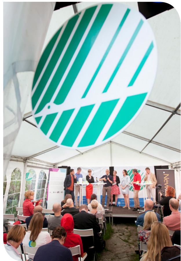
One of Nordic Ecolabelling Sweden’s seminars during “Almedalen Week”.

In November, Ecolabelling Sweden was involved in organising a National Workshop on sustainable consumption and production, with the focus on sustainable lifestyles. This is one of the UN’s ten-year framework programmes (10YFP) and particularly topical in connection with the UN’s new Sustainable Development Goals. The programme in question focuses on the 12 th sustainability goal, which addresses responsible consumption and production. The Swedish Environmental Protection Agency is the main body responsible for this work in Sweden. Ahead of the conference, Nordic Ecolabelling met with a number of people working in the environmental area, and asked what ‘sustainability’ means to them and what we can do. The outcome was a short film that was shown at the conference and later published on YouTube.