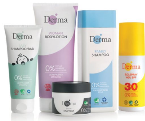
DermaPharm Nordic Swan Ecolabelled products

We plan on continuing with the Nordic Ecolabel since we are an environmentally conscious company. The label emphasizes that our products are environmentally friendly, and The Nordic Ecolabel keeps us up-to-date and helps develop our company in this area. It also helps us tell this story to end consumers better than we can.