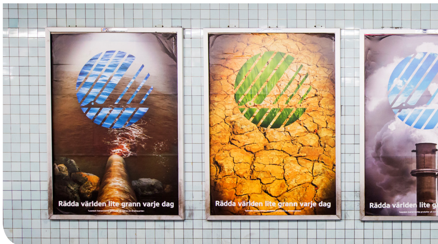
The campaign "Save the world a little bit every day" in Stockholm subway stations.

Procurement is a hot topic, and Ecolabelling Sweden has sought to influence future legislation by means of Op-Eds, comments on proposals circulated for consideration and meetings. Two well-attended seminars on procurement were held in Malmö and Stockholm in autumn 2015, with Ardalan Shekarabi, the Swedish