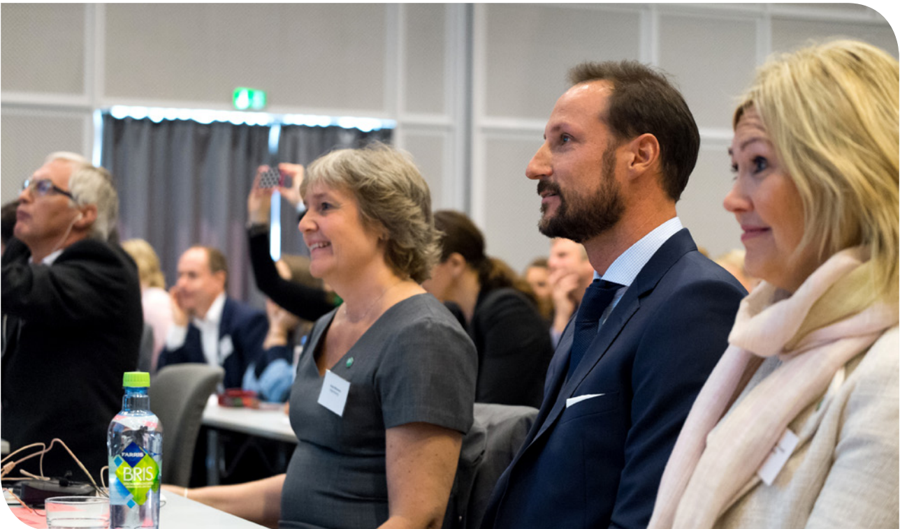
H.R.H. Crown prince Haakon of Norway attended the Nordic Ecolabel's 24th anniversary conference.

a brainstorming meeting with the aim of exploring the possibility of the license holders and importers working more closely with the Nordic Ecolabel in Iceland when it comes to marketing opportunities.