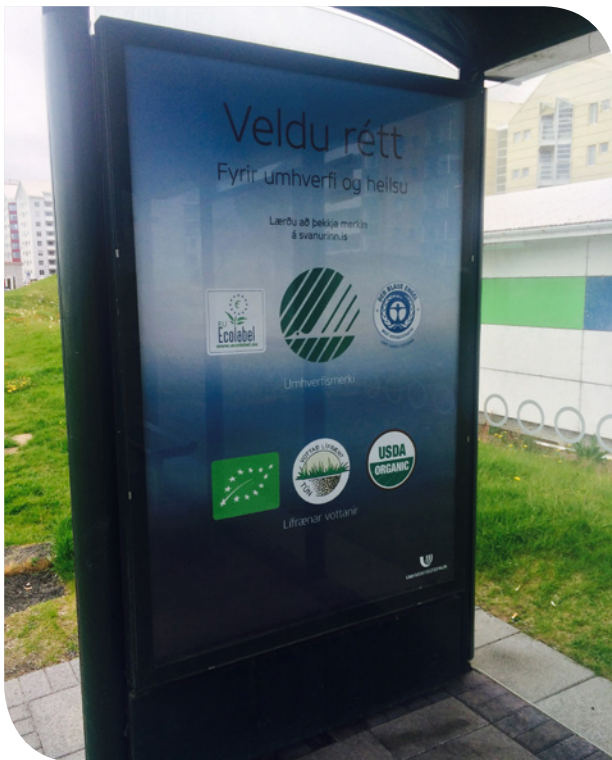
Outdoor campaign in Iceland